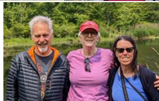
Pictures from our summer hikes: Little Compton Beach, the Watuppa Reservation Tattapanum trail and the Norman Bird Sanctuary. Next up Mt. Hope Farm in Bristol on Sept. 27th!